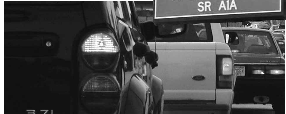
Article by Eric Berkowitz

From where the southern exit of Galt Ocean Drive spills into A1A (North Ocean Boulevard) to the intersection of A1A and Oakland Park Boulevard is an infamous patch of road that seems to spontaneously generate traffic accidents. The stretch is also the unofficial last leg of a motorcycle race track that seems to start just north of McDonalds. Drivers heading south on A1A also regularly ignore the traffic light at the Galt Ocean Drive exit juncture. While the participants in this deadly game of vehicular pinball endanger anyone accompanying them on the road, their activities have also reached into the homes within earshot.