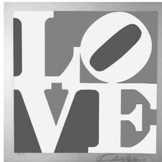
Robert Indiana, Love, Silk Screen, 16 x 16 in., Signed & Numbered, Edition of 395