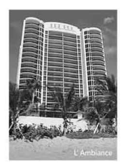
#1 REAL ESTATE OFFICE ON GALT OCEAN MILE WITH OVER 40 AGENTS TO SERVE ALL YOUR REAL ESTATE NEEDS!