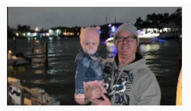
Enjoying the Pompano Beach Boat Parade with my Granddaughter and immediate family.