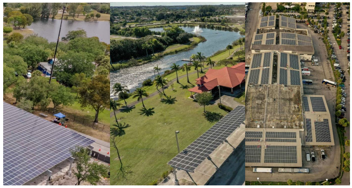
Broward County Solar Projects on County Facilities