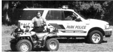
Active Ft. Lauderdale Police Officers equipped with ATV for Beach Patrol and Police Jeep on the street.