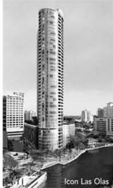
Icon Las Olas