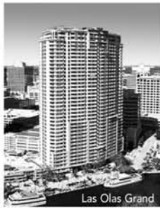
Las Olas Grand