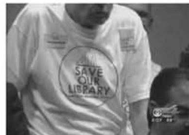
"Save Our Library" T-shirt adorns Galt Mile Resident at Broward Budget Hearing.