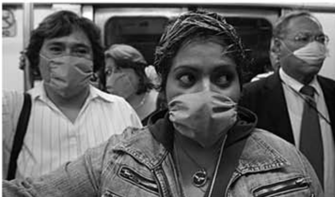
Government distributed surgical masks to protect Mexico City subway riders from Swine Flu.