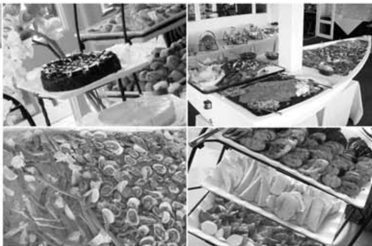
One complimentary bloody mary, mimosa or champagne included

SIGNATURE SEAFOOD STATION, OMELET STATION, CARVING STATION, PASTA STATION, HOT & COLD STATIONS, VARIETY OF BREADS AND AMAZING DESSERTS, CREATIVE BLOODY MARY BAR