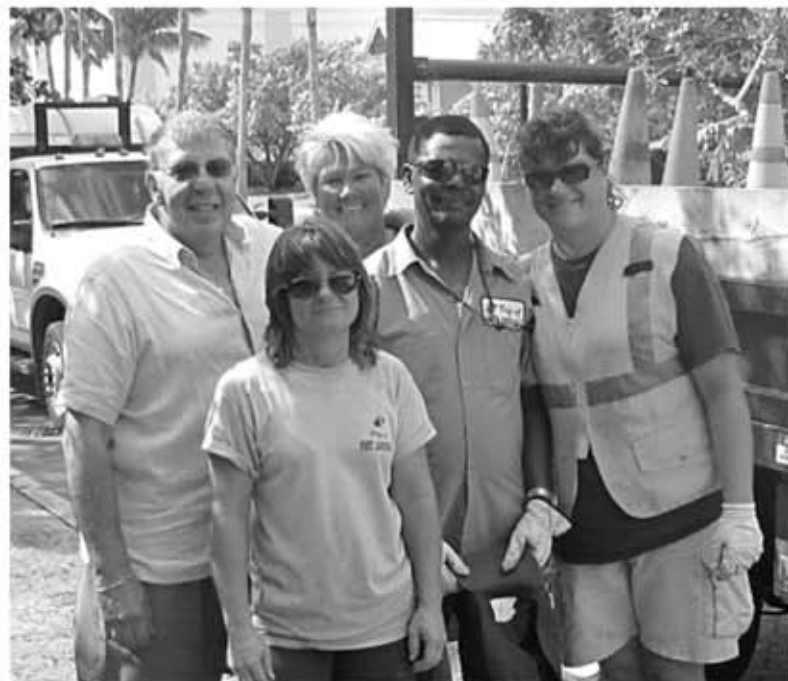
Chepo with City of Ft. Lauderdale Block Maintenance Crew