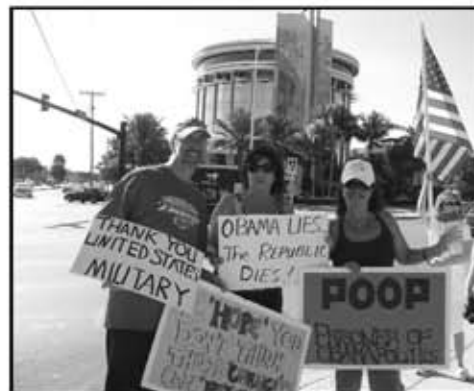
Weekly Tea Party Demonstration at Federal Highway and Oakland Park Blvd.