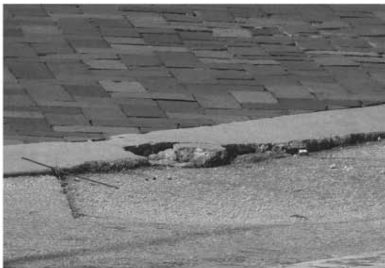
Damaged Street and Sidewalk Create Potential Pedestrian Tripping Hazard