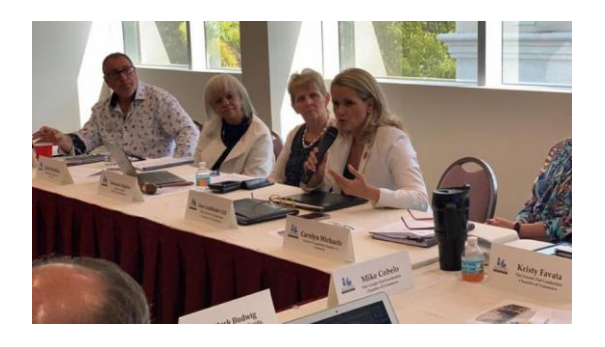
Thank you Greater Fort Lauderdale

Thank you to Bayview Elementary student council for leading the Pledge of Allegiance at our commission meeting.