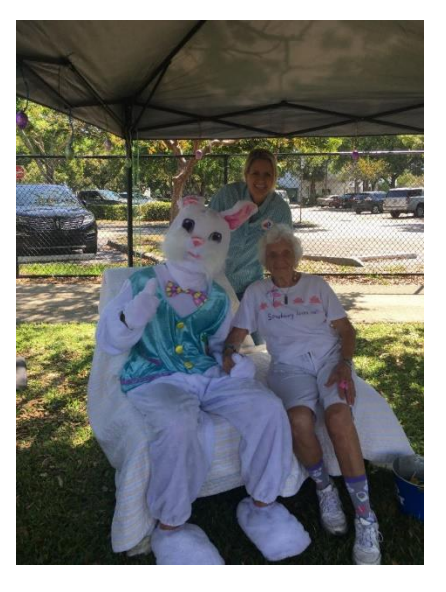
Had a blast at the Imperial Point Spring Fling!

It was a pleasure to attend the celebration of the new 20-acre Northside Hanger Complex and Banyan Air Service's upcoming FBO at Fort Lauderdale Executive Airport.