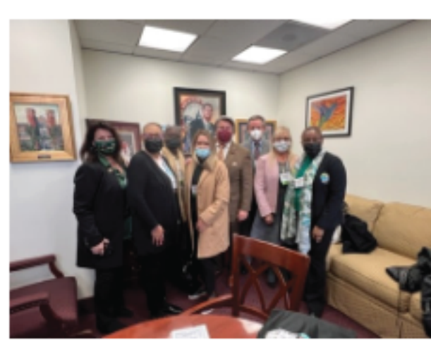
Broward County elected officials meet with Senator Gary Farmer to discuss legislative priorities.