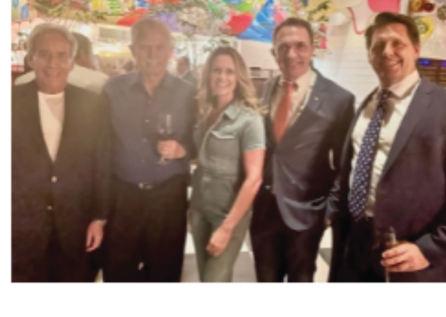
It was so great to celebrate at the opening of Morea, located at 701 North Fort Lauderdale Beach Boulevard. Morea's unique menu is bursting with fresh Mediterranean fare paired with dynamic cocktails and impressive wines. Located in the Paramount building, the patio offers impeccable views which makes for an amazing dinner atmosphere.