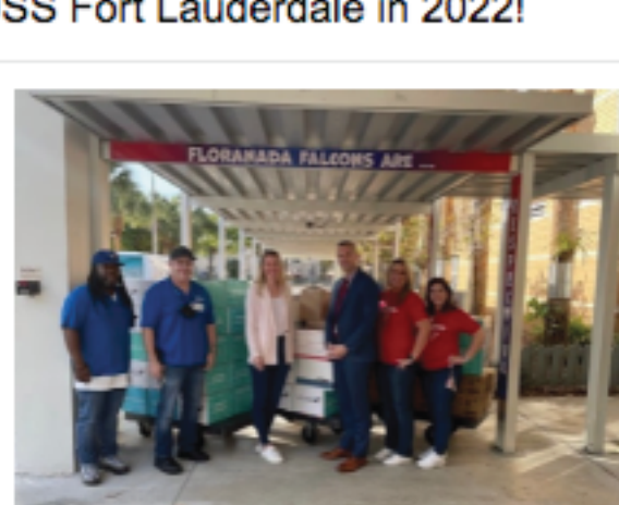
The Broward Education Foundation's mobile delivery team dropped off a special gift for Broward County Public School teachers and counselors at Floranada Elementary School in District 1. Each teacher received a Yoobi box chock full of school and art supplies, including a variety of pens, glue, glue sticks, Lysol wipes and disinfectant spray. 48 boxes, enough for every classroom, were delivered, totaling almost $13,000 in value.