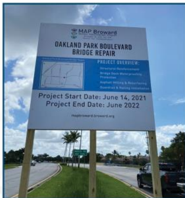
Actual roadway construction sign

The Mobility Advancement Program (MAP Broward), funded by the Penny for Transportation, has made significant advances with projects throughout our community, dashboard updates and updates on the Five-Year Plan. Over $330 million has been spent or programmed for transit operations and capital investments, over $120 million has also been spent or programmed for County highway improvements. Municipal projects and 20 community shuttles have received funding allocations of over $16 million.