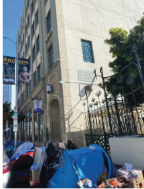
Downtown Women's Center https://www.downtownwomenscenter.org