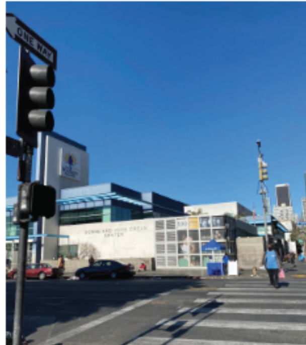
Midnight Mission Donna and John Crean Center https://www.midnightmission.org