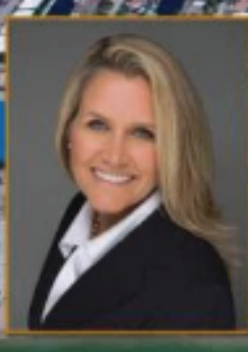
Vice Mayor Heather Moraitis