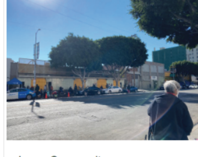
Lamp Community http://www.lampcommunity.org