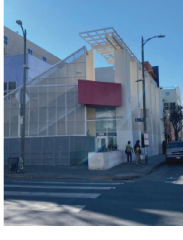
James Wood Community Center https://www.srohousing.org/sro-community-development.htm