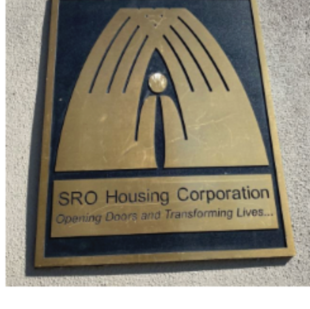
SRO Housing Corporation https://www.srohousing.org/sro-community-development.htm