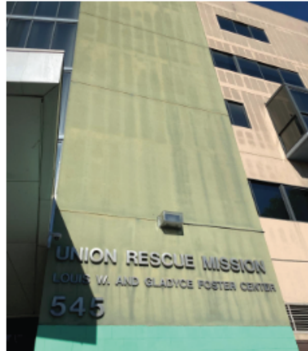
Union Rescue Mission https://urm.org