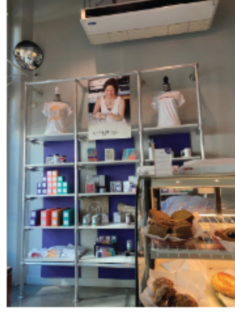
MADE by DWC is a purpose driven social enterprise created by The Downtown Women's Center to empower women in Los Angeles to break the cycle of chronic homelessness through employment. https://www.madebydwc.org