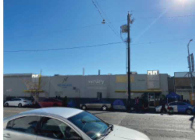
Wesley Center jwchinsitute.org