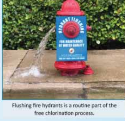
Flushing fire hydrants is a routine part of the free chlorination process.

Free chlorination is a common preventative maintenance procedure for water systems using chloramines for disinfection. The City expects the chlorination period to be transparent to our neighbors; however, some may notice a slight change in the taste or smell of their tap water. In addition, neighbors may see fire hydrants running in their neighborhoods, which is part of the normal maintenance process.