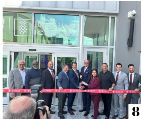
(5) Broward Metropolitan Planning Organization, (6) City of Lighthouse Point Commission Meeting, (7) Town of Lauderdale By The Sea Commission Meeting, (8) Baptist Health IcePlex Ribbon Cutting Ceremony