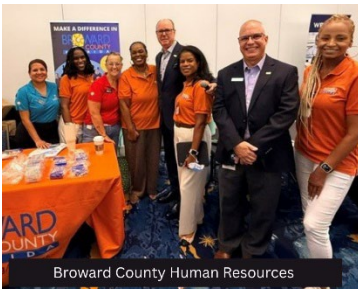
Broward County Human Resources