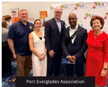
Port Everglades Association

Broward County's Port Everglades recently hosted a career fair and expo to show case the multitude of companies looking to hire talented, career minded individuals from our community. I had the opportunity to witness the incredible successful event, as hundreds of people swarmed our Broward County Convention Center in search of their perfect career match. If you missed the event, I encourage you to visit, Port Everglades to Host Career Fair & Expo , for more information about the companies that may still be looking to hire professionals in our community.