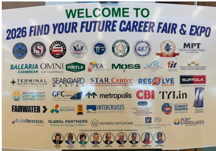
Some of the participating companies at the job fair!