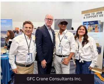
GFC Crane Consultants Inc.