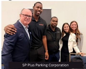
SP Plus Parking Corporation